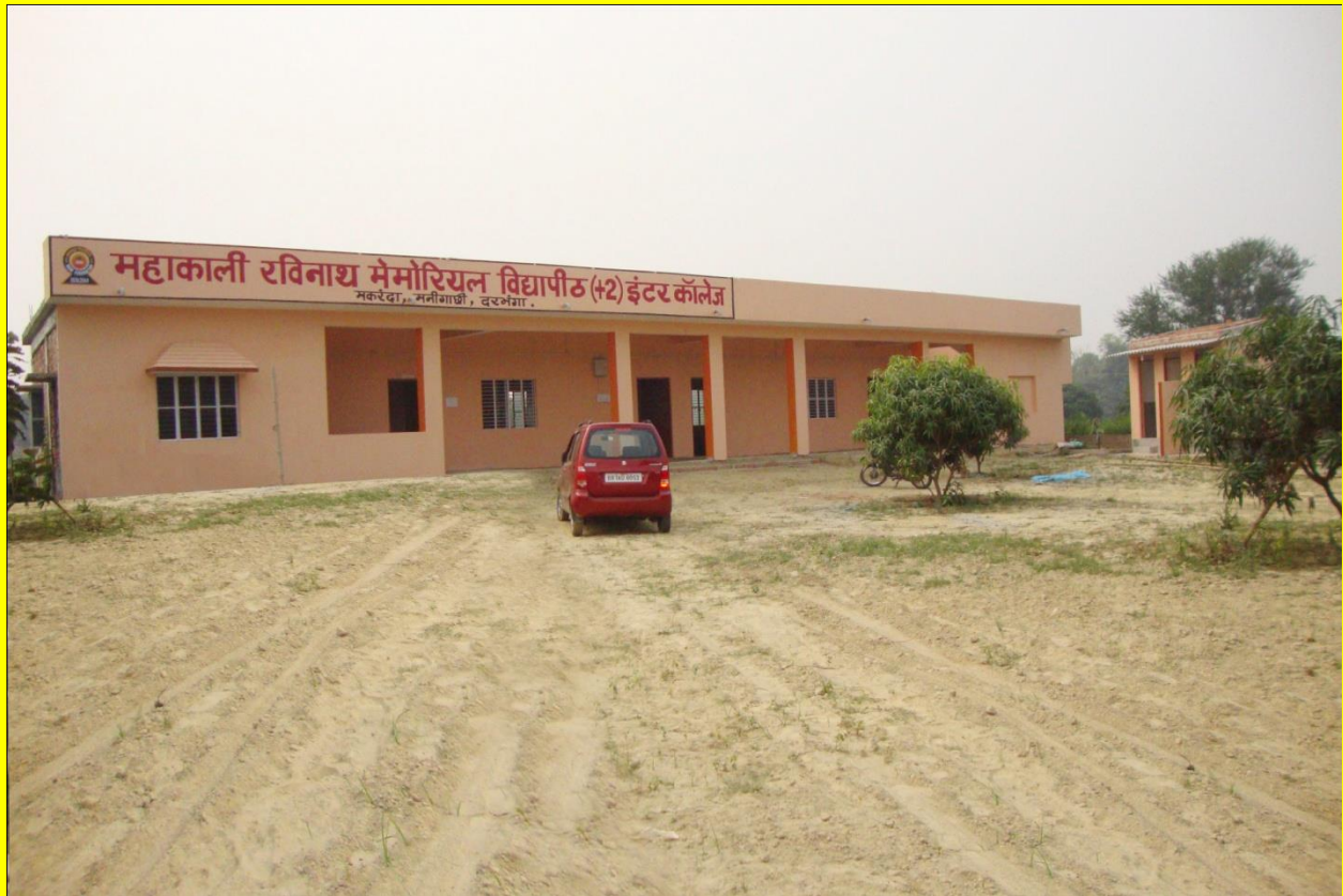
MRM VIDYAPITH +2 INTER COLLEGE MAKRANDA, MANIGACHHI, DARBHANGA